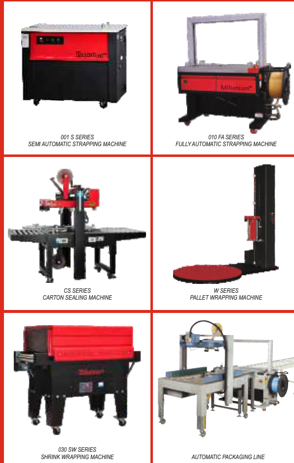
001 S SERIES SEMI AUTOMATIC STRAPPING MACHINE