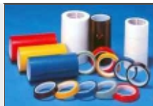
SELF ADHESIVE TAPES