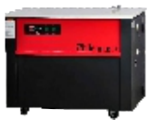
SEMI AUTO STRAPPING