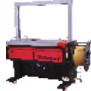
FULLY AUTO STRAPPING