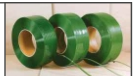
PET STRAPPING ROLLS