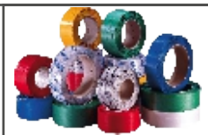
PP STRAPPING ROLLS